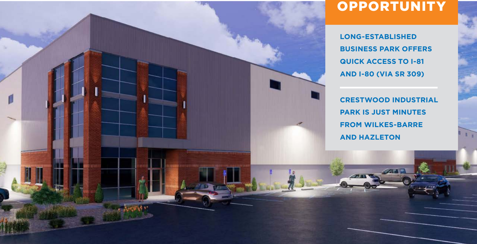
SAMPLE BUILDING PHOTOS

CRESTWOOD INDUSTRIAL PARK IS JUST MINUTES FROM WILKES-BARRE AND HAZLETON